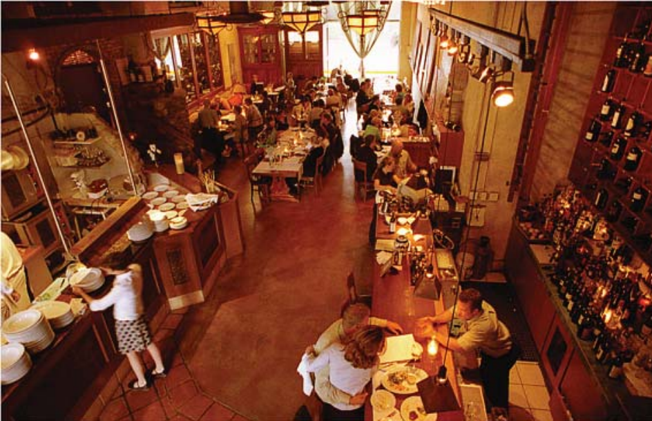
BAR AND DINING ROOM AREA